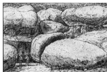
Rocks at Girraween

We will meet at Roma St Station at 10am, and make our way to the River and then follow the bikeway up to the Bridge. We will come back via South Brisbane and the Kurilpa Pedestrian Bridge.